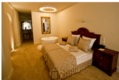
Garden Boutique Hotel

Garden Boutique Hotel is a facility located in the very heart of Poznań. This 19th century antique town house has been meticulously renovated, which gives the hotel a unique boutique character, combining intimacy, cosiness and serenity.