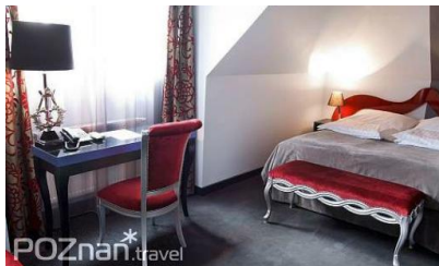
City Solei Boutique Hotel****

If you wish for your accommodation to be right at the heart of the Old Town, check out one of the hotels listed below.